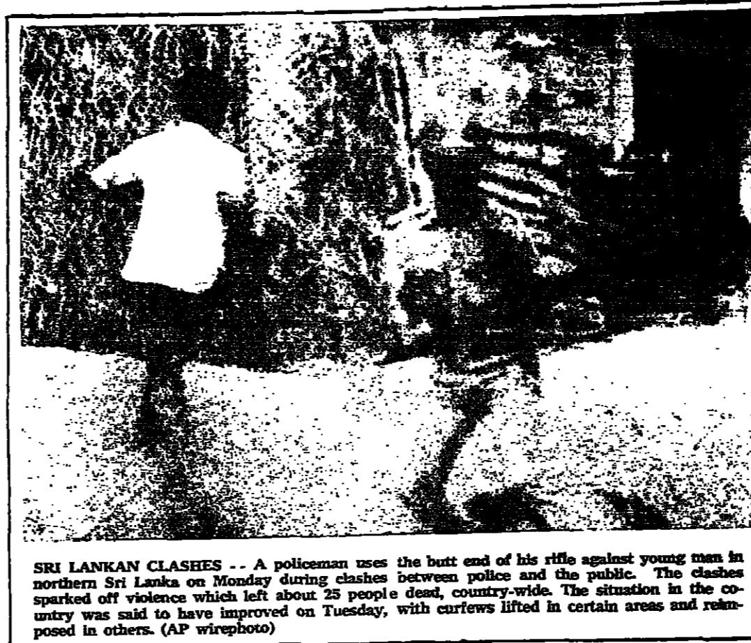
SRI LANKAN CLASHES -- A policeman uses the butt end of his rifle against young man in northern Sri Lanka on Monday during clashes between police and the public.

The Communist Party newspaper Trybuna Ludu said that the first day of the visit confirmed the conviction here that it would contribute to even closer cooperation.